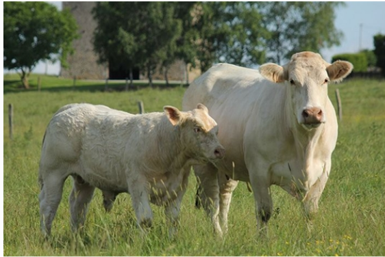
DOUCHKA, BANCO's daughter and her VIVIERS ' calf.