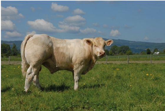
Son of FALCON GAEC DE CHARNANT (42)