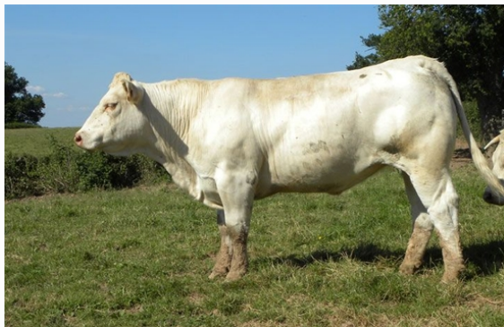
Daughters of VIVIERS - 30 mont - Agonges station