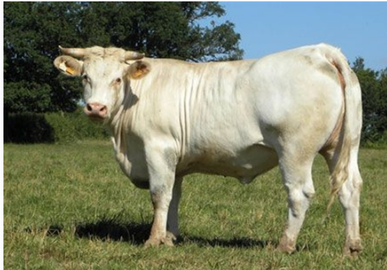
Daughters of VIVIERS - 30 mont - Agonges station