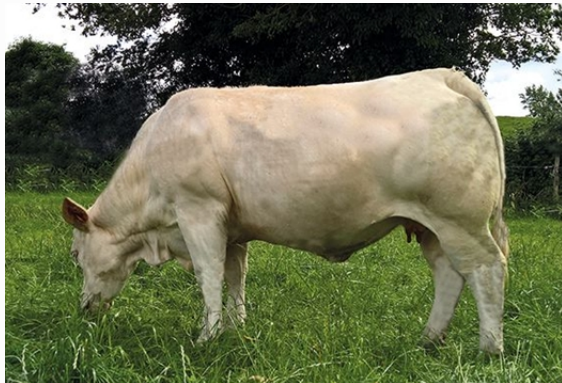
ICAZA - daughter of FIRST - Gaec le Sautreau (79)